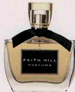
Faith Hill Parfums, Coty Inc. , $31; JCPenney